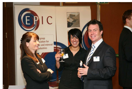
EPIC at QPA Showcase 2007